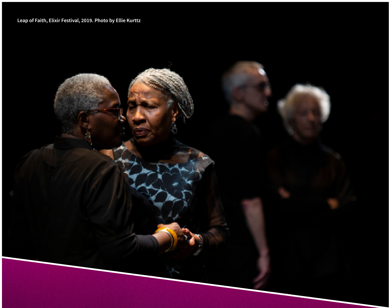
Leap of Faith, Elixir Festival, 2019.