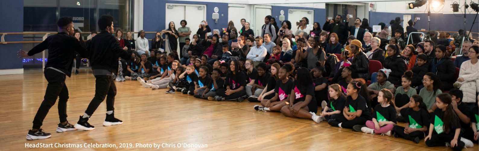
HeadStart Christmas Celebration, 2019.