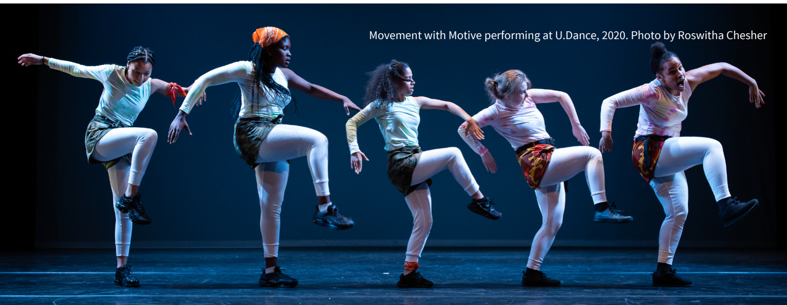
Movement with Motive performing at U.Dance, 2020.

"These girls are a force to be reckoned with when it comes to commitment and drive. They are always ready for a challenge and go the extra mile. They never give up and always make it easy for others to make friends." Amanda - Youth Dance Support Worker