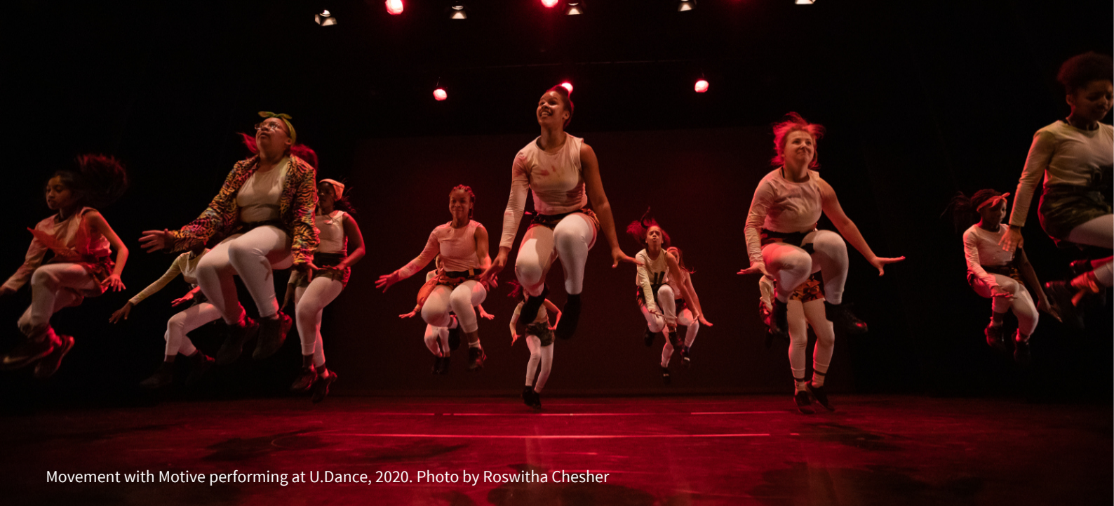
Movement with Motive performing at U.Dance, 2020.