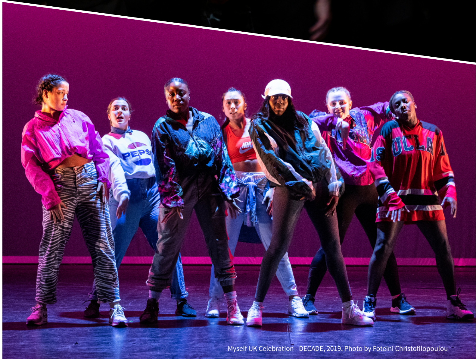
Myself UK Celebration - DECADE, 2019.