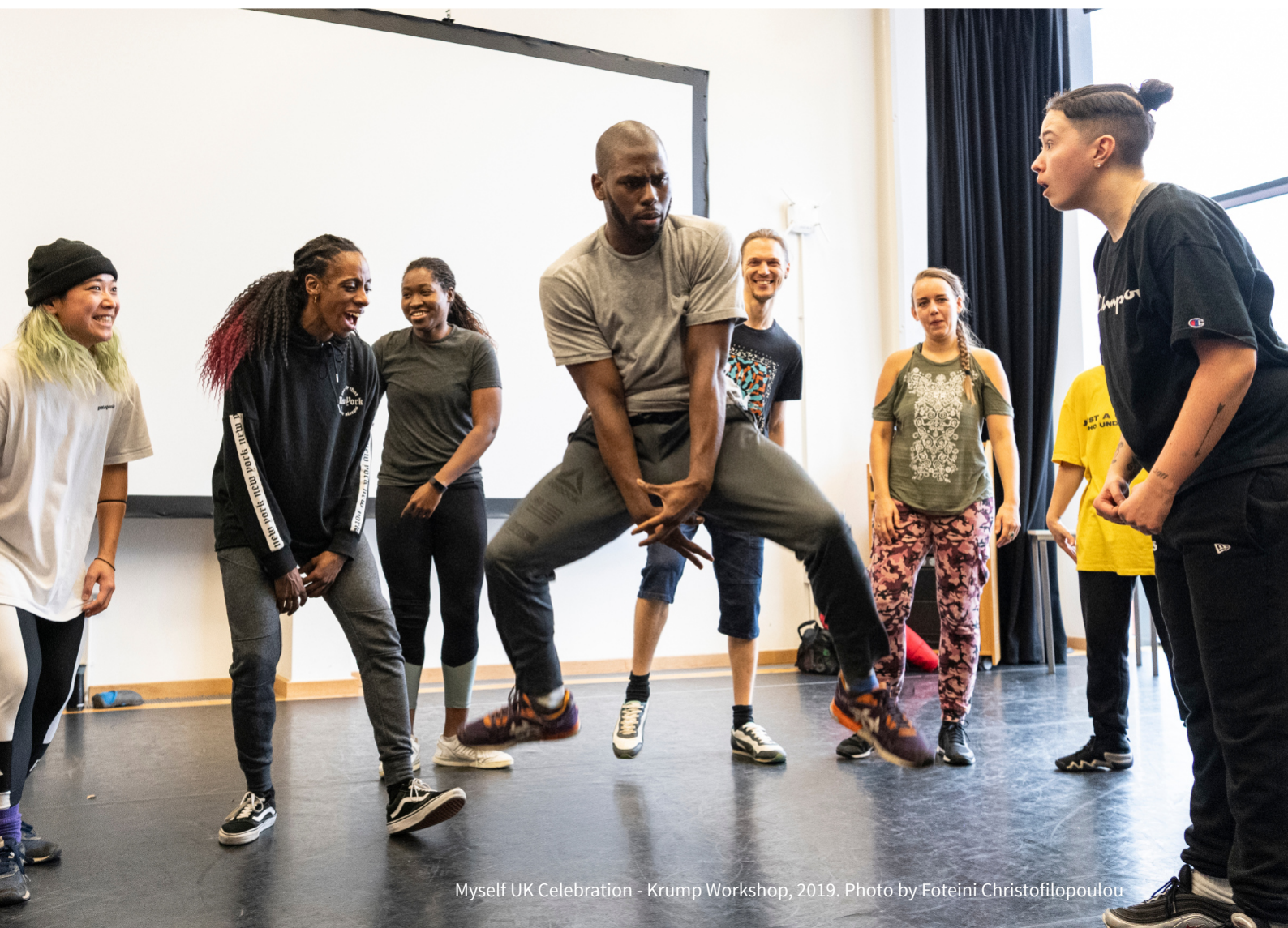
Myself UK Celebration - Krump Workshop, 2019.